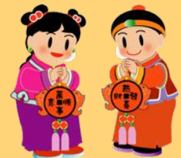
Photo Taking Days

The photo taking days for our school will be from 18 th to 22 nd March 2019. Your child will have both individual and class photos taken. Parents will receive sample individual photos and the class photo will be posted on the reception boards for you to view. It is OPTIONAL for parents to order the photos. The photos will also be used for our school yearbook.