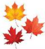
樹葉 Shù yè