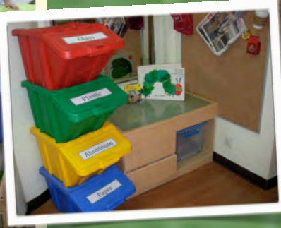
Turtles, recycling centre and the compost.