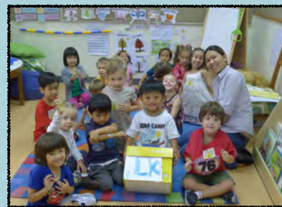
LK1 class with the sticker they received for the Dress Casual Day, proudly holding their donation box.