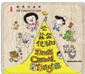
DRESS CASUAL DAY 2011

Parents can facilitate by discussing local and global issues that are significant to your child, as well as participating in community events! Document your child's attitude towards helping in and their action in the community. Pass it onto the teachers and we will place it in your child's portfolio to share his achievements! There will be more community events in the school year, so stay tuned and be ready to give back to the community.